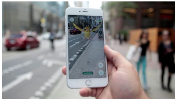
Fig. 1: Pokémon Go on iOS [5]